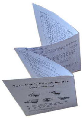
Multiple View, More attention!